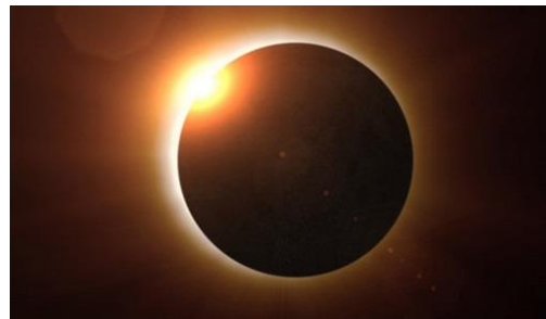
During a total solar eclipse, the moon blocks out the disk of the sun.

Get ready for August 21, 2017. Not since 1918 has a solar eclipse been visible from coast to coast in the United States! This year's will be 90% visible in our area and 100% visible in southern Illinois! However, it is important to wear proper eye protection to view it. NASA offers some advice on viewing, please click to learn more . Be careful when walking or driving because as the event takes place, it may be distracting to those around you.